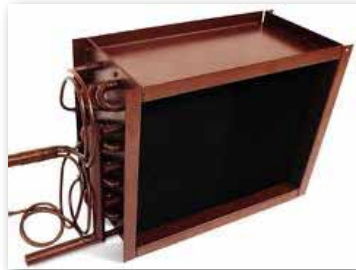
Heresite coatings extend the life of coils both large and small.

Fifty years ago, Heresite was the first company in North America to apply coatings to aluminum finned copper tube coils. Today Heresite is one of the leading aftermarket coil coatings in the world because Heresite Phenolics combine superior chemical resistance with ease of application.