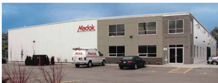
The Madok plant in Brantford, Ontario

Each HERESITE® corrosion protection solution is a combination of a superior coating product - proven over years of use in the field across a wide variety of the most demanding operating environments – that can be tailored to meet the unique requirements of specific industry applications, AND Madok's consistently superior level of customer service that produces unsurpassed customer benefits.