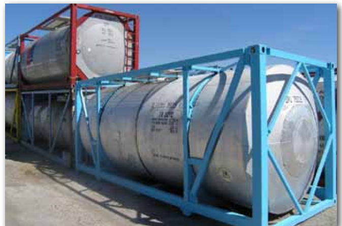
Heresite lining protects iso-tanks from harsh chemicals.

We offer both heat cured and cold set coating and linings including phenolics, epoxy phenolics, epoxies, and urethanes. Our linings are designed for extreme immersion service with resistance to acids, alkalines, and high salinity environments. They are resistant to high and low pH environments and most meet FDA requirements of 21 CFR 175.300.