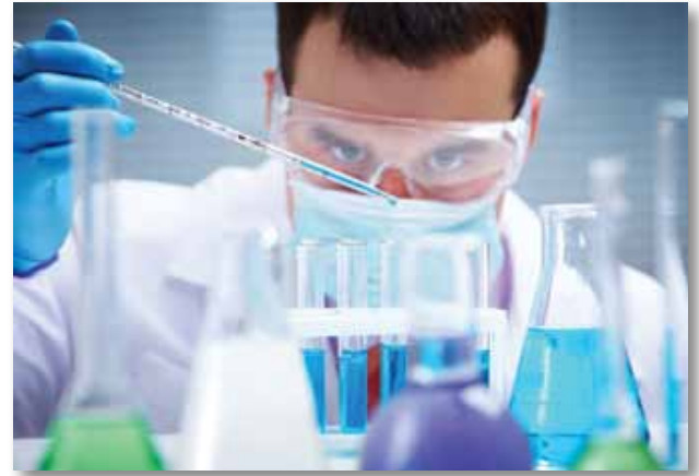
Coatings can be custom tailored to clients' needs

All types and sizes of Coils, Radiators and HVAC/R equipment can be Heresite Coated with our P-413C heat cured phenolic in our facility. It will protect them against damaging environments such as salt air, acid rain, and swimming pool chlorine, as well as most other corrosive atmospheres. The coating will extend the life of the coil or radiator several times compared to an uncoated coil and the effect on heat transfer is negligible.