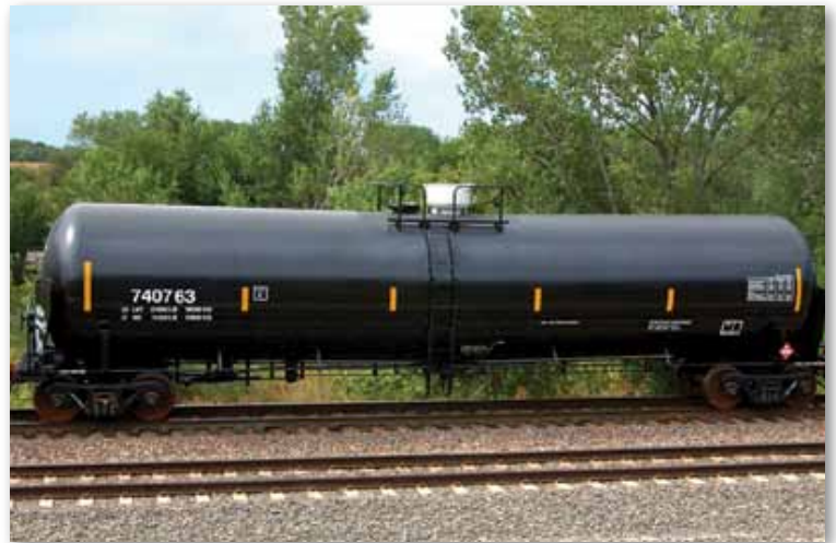
Heresite coatings protect railcars from corrosive attacks.

Contact us for our Heresite Chemical Resistance Guide and our recommendations for your chemical environment. Many of the Heresite Linings meet FDA requirements of 21 CFR 175.300.